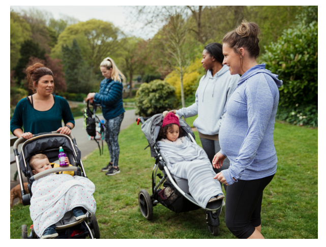
Events can be open to all kinds of groups, housed inside or outside. We're excited to see how wellbeing and culture combine.

They acknowledged that 'the impact of arts can literally change lives'. With all this in mind, CWN are planning a Wellbeing Season called 'Summer of Wellbeing' which will take place across Newham from June-September 2024.