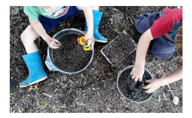
Projects may work with adults or children, or both!